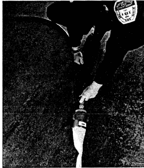
Figure 2- throw bag techniques